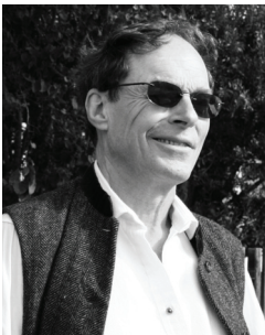
Alexander Cockburn http://www.counterpunch.org

Alexander Cockburn, celebrated columnist at The Nation and other venues and co-editor of the online magazine Counter-Punch , spent an evening in Aberdeen during October 2005 as the Institute's first speaker. Cockburn held an audience of more than 150 spellbound for over two hours with his witty, searing analysis of current events in the United States.