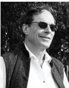
Alexander Cockburn http://www.counterpunch.org

Alexander Cockburn, celebrated columnist at The Nation and other venues and co-editor of the online magazine Counter-Punch , spent an evening in Aberdeen during October 2005 as the Institute's first speaker. Cockburn held an audience of more than 150 spellbound for over two hours with his witty, searing analysis of current events in the United States.